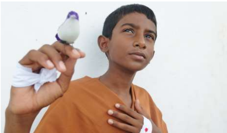
"Lord, make me an instrument of Thy peace." St. Francis of Assisi (Simeon).