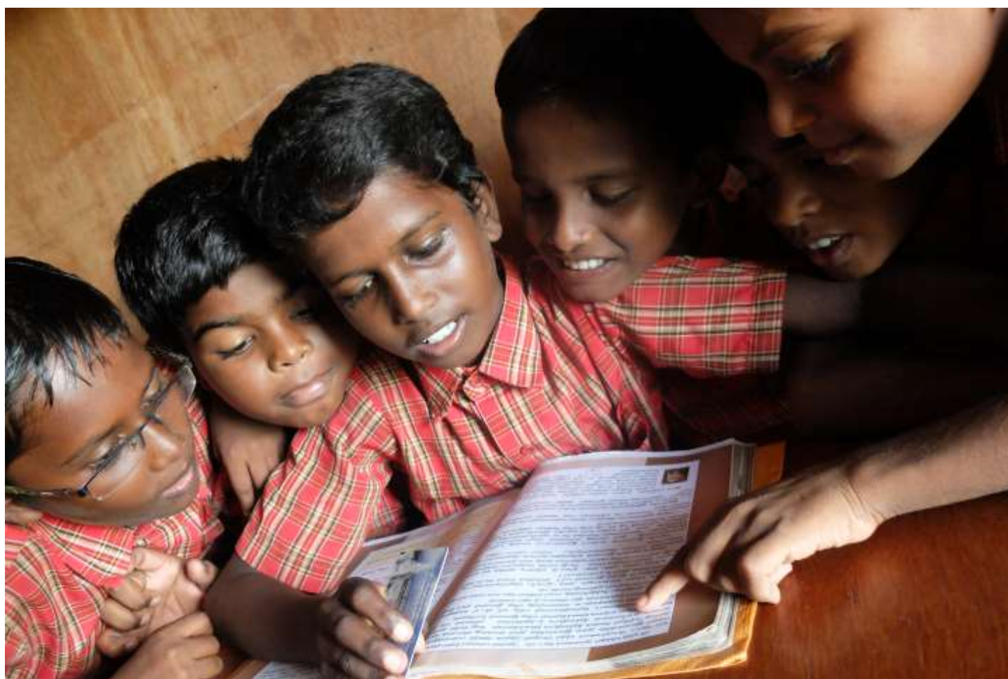
“Look here boys! It says that as you approach the speed of light, time slows down. That means, the slower we are, the faster the lesson goes!”