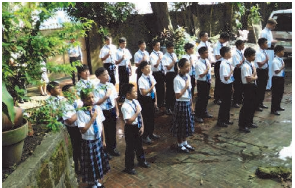
Morning Prayers and the National Anthem before school.

have over the OLVS boys, however, is a predilection for violent games, but I am sure this will come with time.