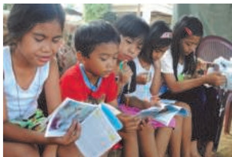
Children absorbed in their new rosaries and prayer booklets.

find one priest struggling with 18,000 parishioners. The natural solution was adopted and lay catechists were formed and they did great work in educating the youth and in maintaining the faith so that the sacraments were fruitfully received. This work of forming catechists was taken very seriously and applied with vigour. For instance, the Catholic University in Osamis, was originally an institution for training a large body of well-prepared