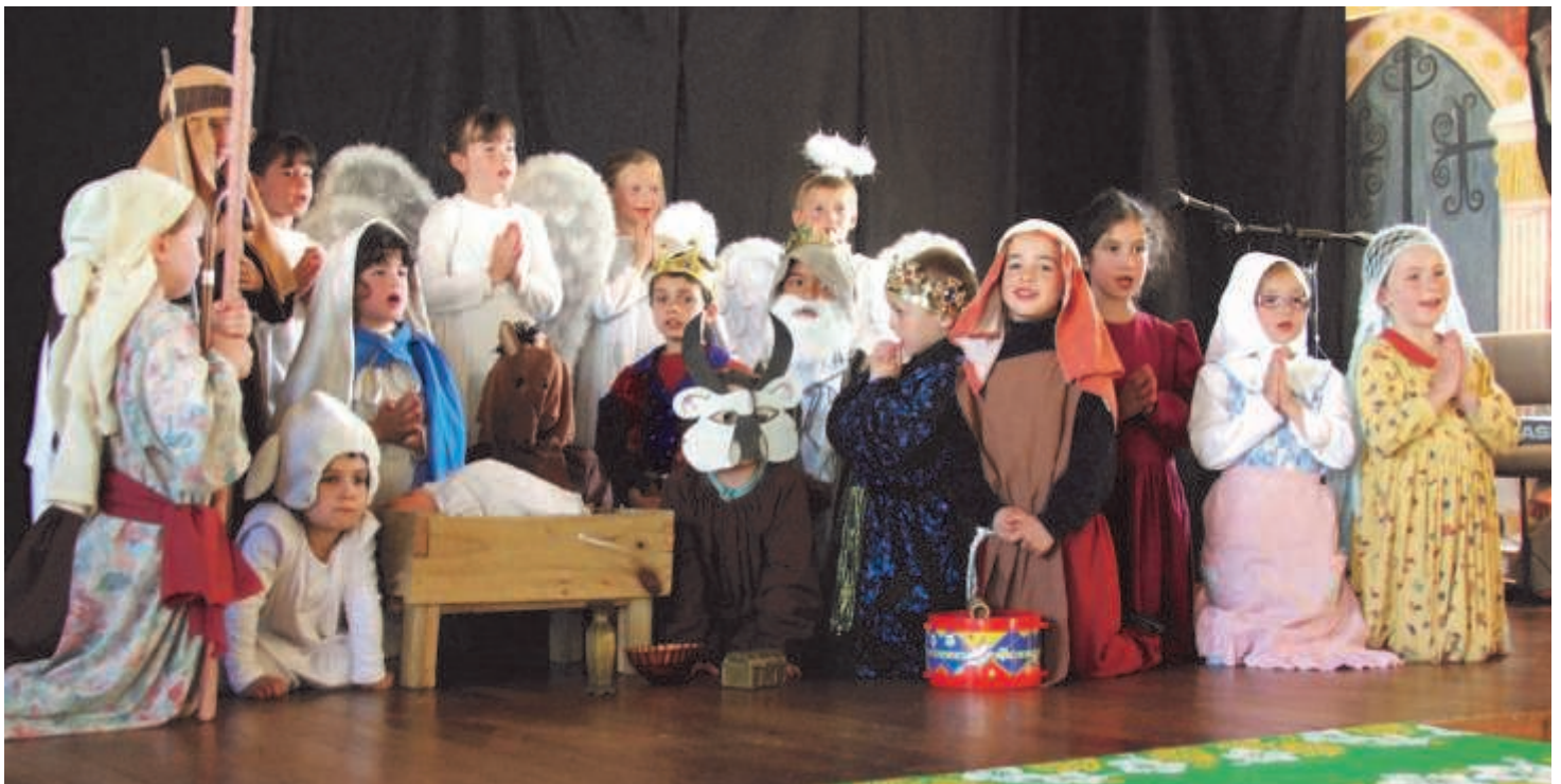
No room at the inn, but plenty of room on the stage for the St. Anthony's Junior School nativity play.

The Secondary School end of year prize-giving held on December 1st was an occasion of celebration for many students