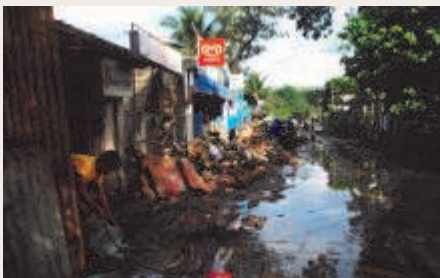
Aftermath of the flood: mud and more mud.