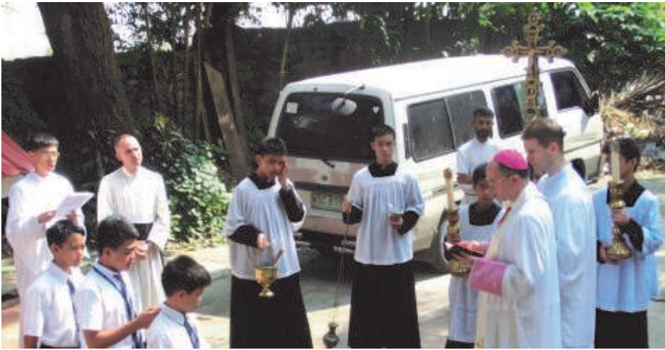
Bishop Fellay blesses the new Our Lady of Victories School on the Feast of the Assumption.