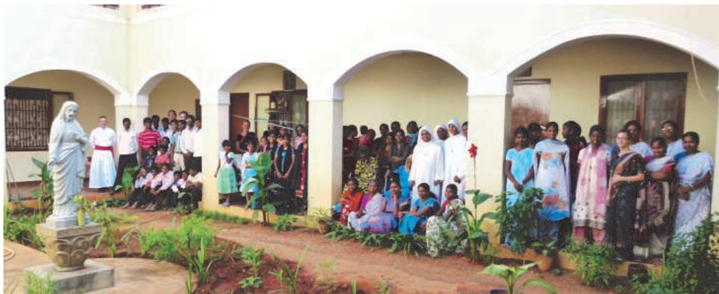
Christmas 2011 at the Orphanage.