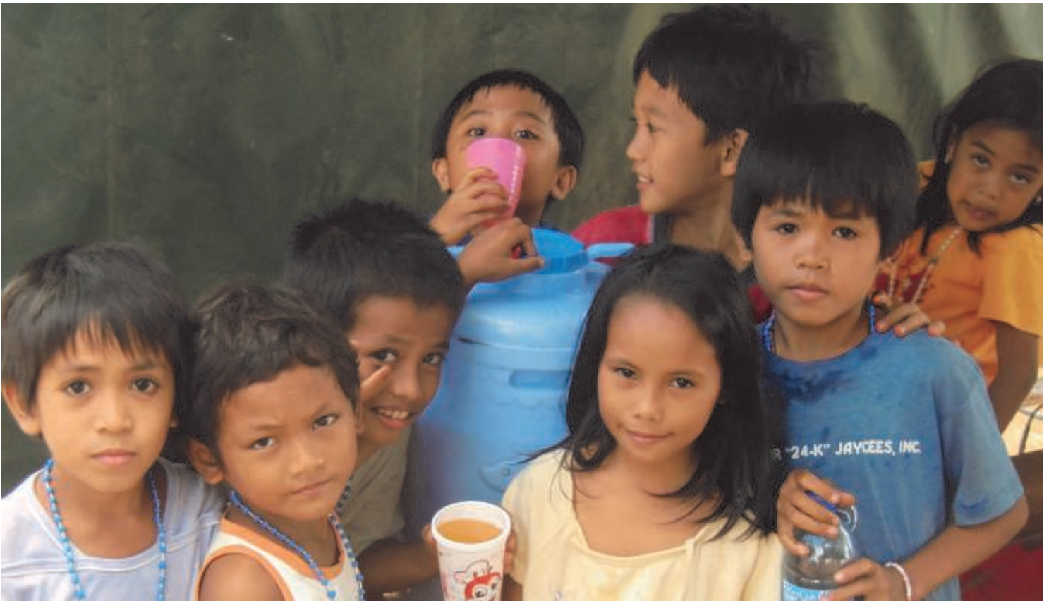
Flood victims: children of Mindanao, Philippines with new rosaries and relaxing at the makeshift juice bar.