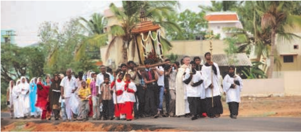
The rosary procession from Veritas Academy to the priory on the Feast of Holy Rosary 8th October.