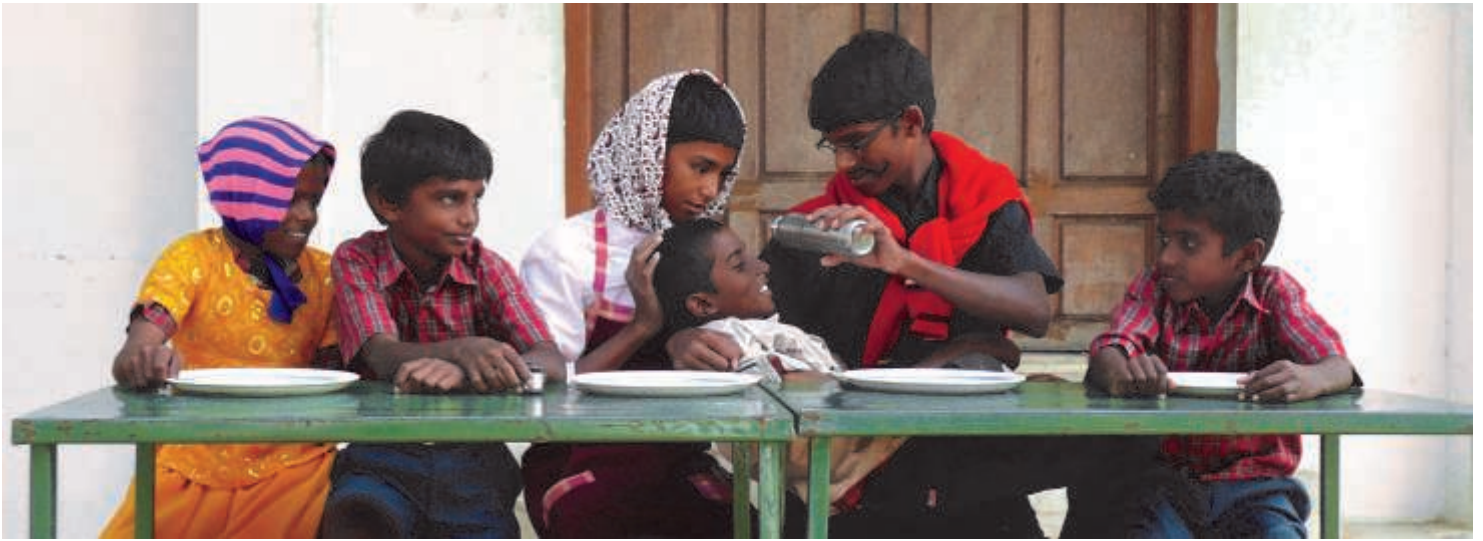
Domestic bliss in the Cratchit household. A scene from Charles Dickens' A Christmas Carol.