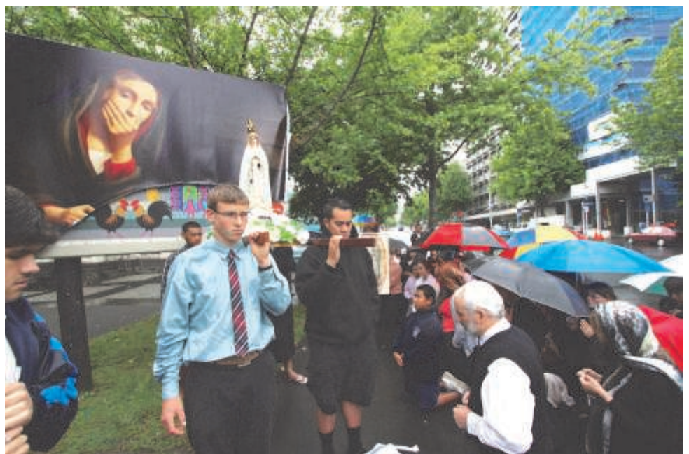
Soldiers of Christ make reparation in front of the blasphemous poster.