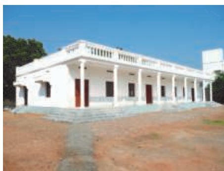
The New Boys Dormitory & Study Hall thanks to our benefactors.