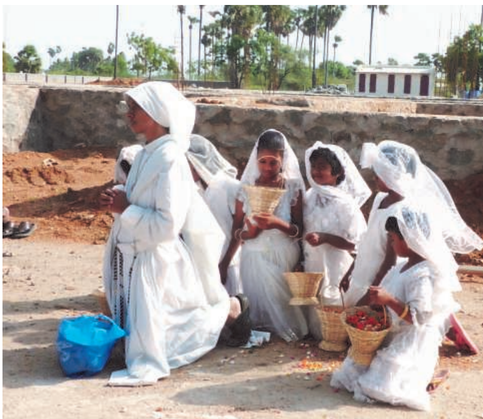
Maids of Honour at the Corpus Christi procession earlier in the year.