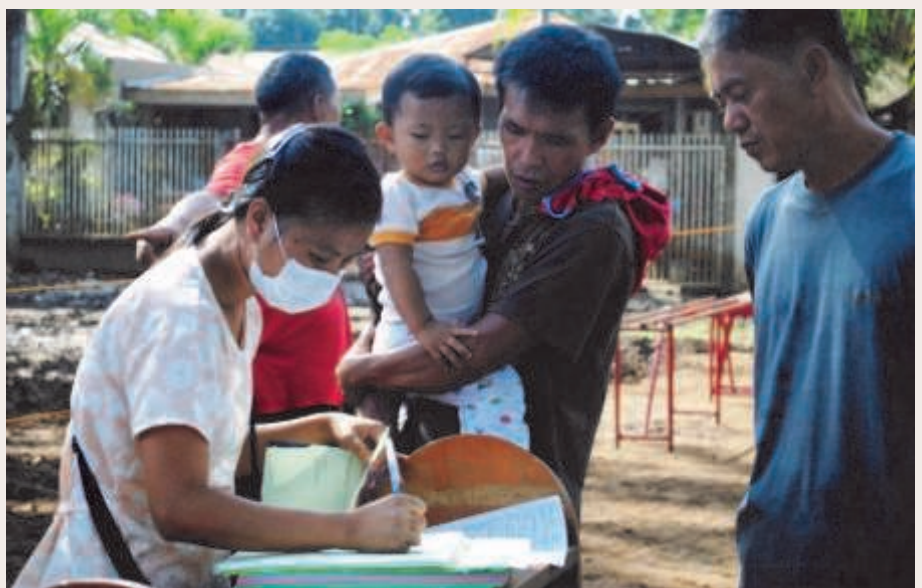
... while the ACIM medical team look after their bodies.