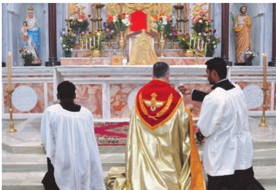
The new altar at St. Thomas' Chapel, Nagercoil, covered in flowers, made the Feast of St. Thomas especially memorable this year.

tion of the natural order, which includes the perfection of the family, is impossible without grace . For a family to be truly functional, it must be truly religious. It must take the Holy Family as its model and must aspire to supernatural virtue through, not only material means (eating and sleeping well, shutting out the evil influences of the world, etc.), but especially by frequentation of the sacraments, prayer in common (the family rosary) and a practice of virtue.