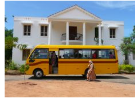
The bright, shiny, new orphanage bus is a welcome addition to the orphanage fleet consisting of a jeep, 2 scooters and 4 bicycles.