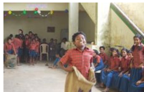
One of the competitors on "Children's Day" at Veritas Academy. Throughout India, classes are replaced by games to give everyone the chance to make even more noise. The children enjoy it.

foresaw from all eternity the plunge in building commodity prices (iron, steel and cement) at the onset of the current global recession and may have deliberately stayed our hand until those price falls filtered down to the Palayamkottai market. This is yet another example of how the Catholic Faith can make sense of the tumultuous world in which we live. Ω