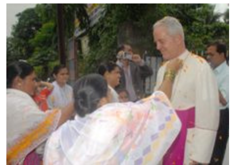
A shower of petals after Mass.

The next day, Sunday, after many days of meticulous preparation, 15 souls received the sacrament of confirmation in front of 400 faithful at the partially restored St. Gonsalo Garcia Church in the Bassein Fort at Vasai (north of Bombay). His Lordship processed to the church from the sacristy located in the neighbouring ruins of the Church of the Immaculate Conception.