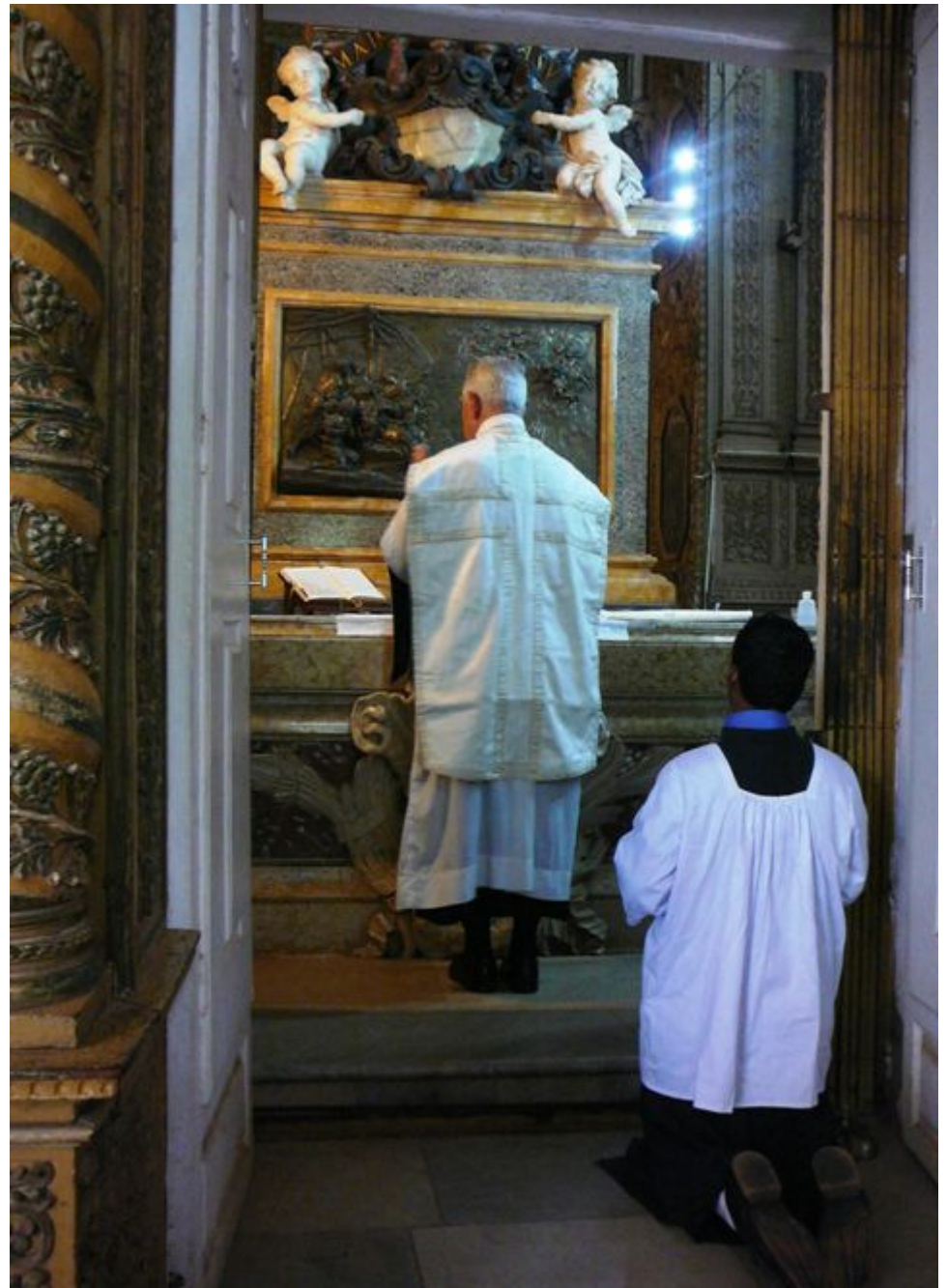
The Holy Sacrifice of the Mass upon the tomb of St. Francis Xavier in Bom Jesu, Goa.