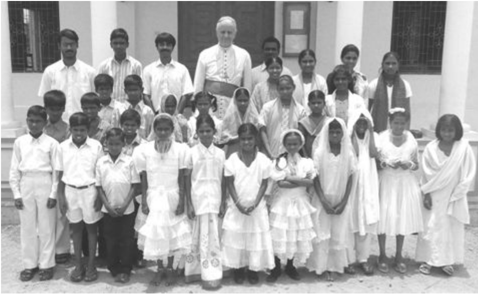
Young confirmands from the orphanage and Mass Centres served from Palayamkottai.

The next stop on the pontifical tour was Palayamkottai. On Sunday 24th August, 30 souls received the sacrament of confirmation and were treated to a conference by His Lordship in the afternoon on the dangers of the modern world which are now changing the face of India (television, cinema, modern fashions,