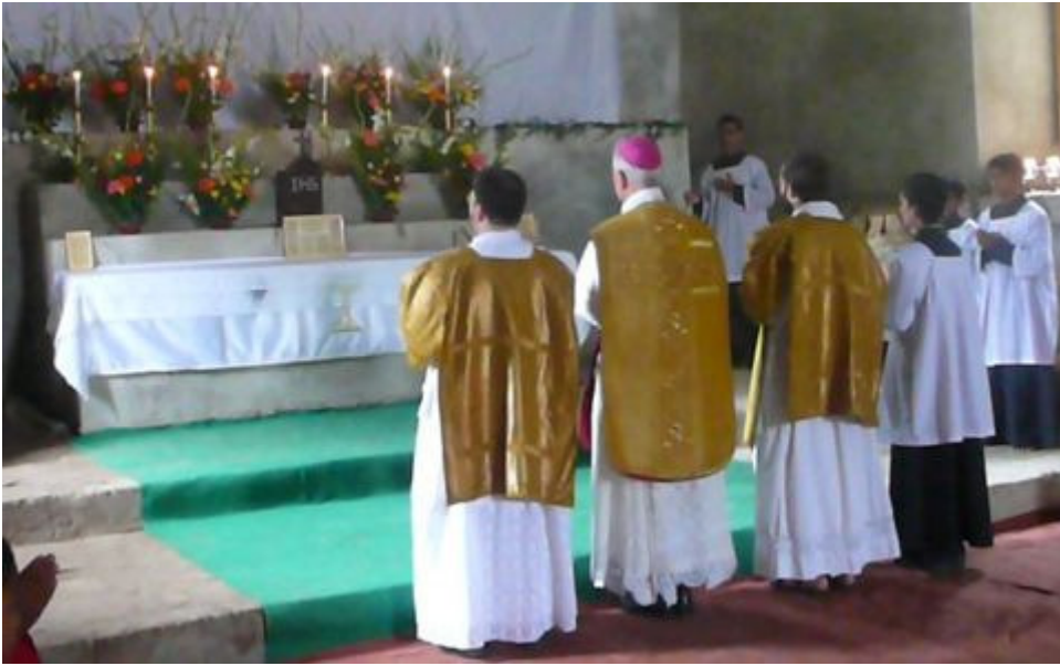
“Introibo ad altare Dei” before the high altar of St. Gonsalo Garcia Church.