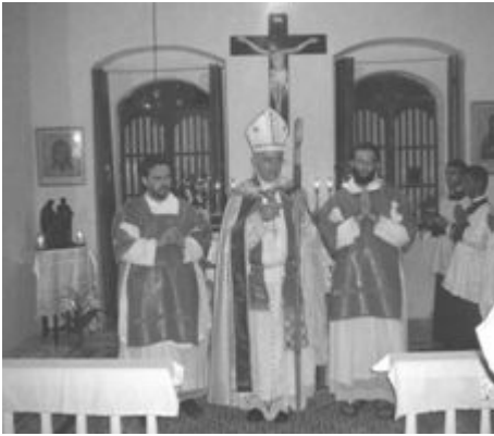
Confirmations at Salvador do Mundo, Goa .

On Monday afternoon His Lordship, escorted by the two priests of the North, departed for Goa to visit the decaying splendour of what was once the 'Rome of the East.' It is heartbreaking to see how this verdant arm of the Church has withered since the Second Vatican Council and the annexation by India in the sixties (Hinduism is being heavily promoted by the state as a national religion).