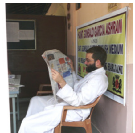
Business as usual.