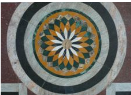
Floral decoration in polished granite.