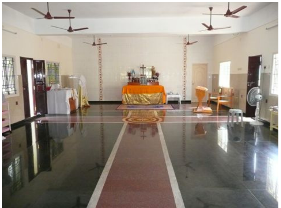
The interior of the new chapel. The floor is made of polished granite.

the utilities. This was while he was running his own demanding business at the same time. May God grant all those who helped a rich reward.