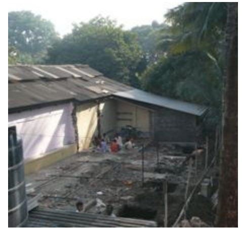
Construction at the new priory is underway.

The Northern Circuit continues to blossom anew. The first overseas teacher has been engaged at the St. Gonzalo Garcia Orphanage school to and plans to take-over the running of the orphanage and school are being discussed. Ω