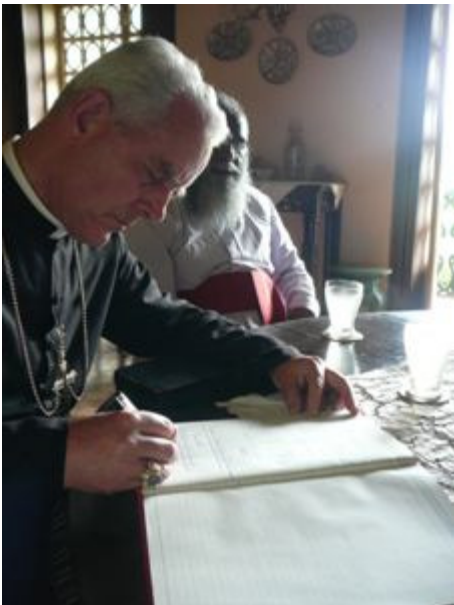
His Lordship writes his memoirs.

His Lordship, guided by one of the faithful, visited many churches including the Cathedral and the Basilica of Bom Jesu where he was fortunate enough to celebrate the Mass on the tomb of St. Francis