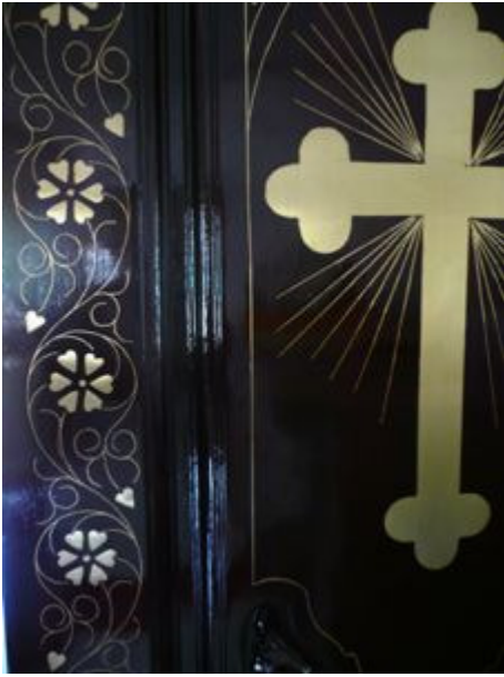
Solid Burmese teak doors inlaid with brass were donated to the chapel.

After two years of planning and construction, the new chapel at Trichy (300km north of Palayamkottai or six hours by train) was unveiled on the occasion of His Lordship's visit to India.