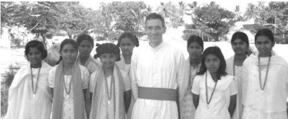
Nine young ladies became the first Children of Mary at Palayamkottai on the Feast of the Immaculate Heart of Mary. The purpose of the Sodality of the Children of Mary is to encourage its members to become true "handmaids of the Lord" by imitating the virtues of the Blessed Virgin Mary.