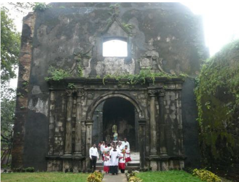
On the feast of the Assumption, the faithful of Vasai process with a statue of Our Lady from the ruins of the Immaculate Conception Church in Bassein Fort.