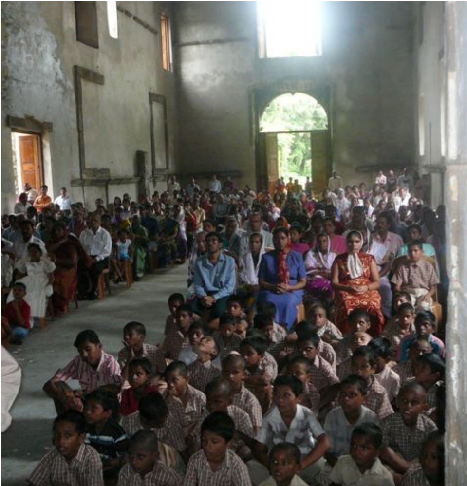
Angelic orphans from the St. Gonsalo Garcia Ashram listen attentively to His Lordship’s sermon.