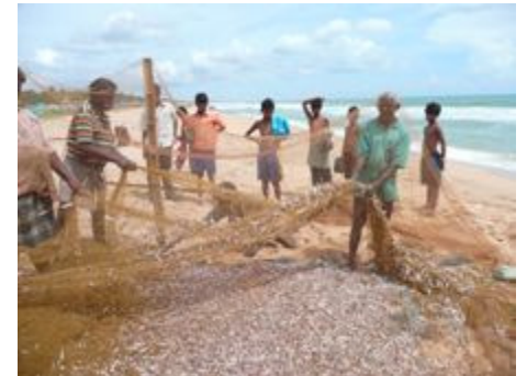
On a visit to the south coast, the boys watch some fisherman shake the small fish (sprat) from their nets. Afterwards they spent two hours in the crashing waves.