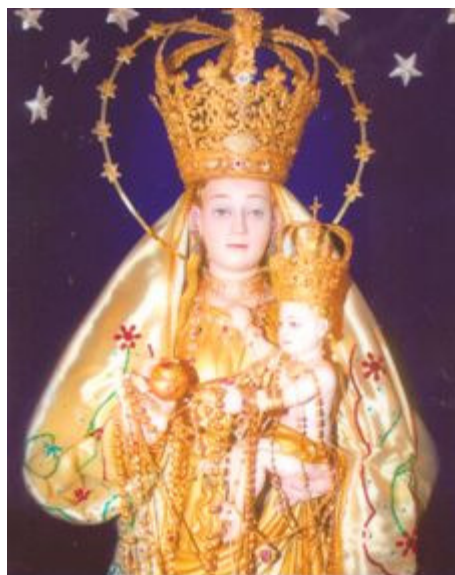
Our Lady of the Snows, Tuticorin. 15