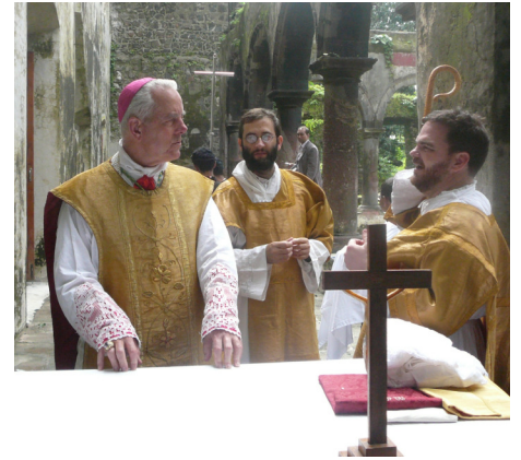
In the sacristy: “My Lord, do you mind if I borrow this crosier for a minute, I need to whack one of the boys over there?”