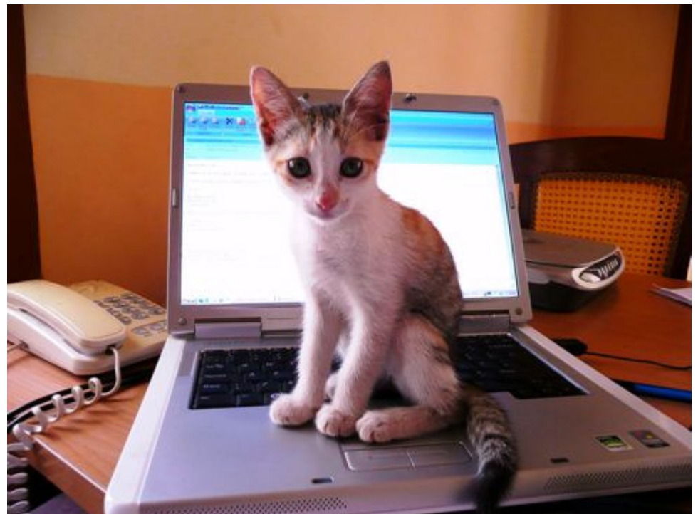
“Now listen Father! It’s either me or the computer.” Magnificat, the new priory rat catcher, puts her paw down.