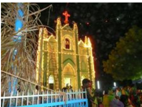
The illuminated Chapel of St. Anthony.