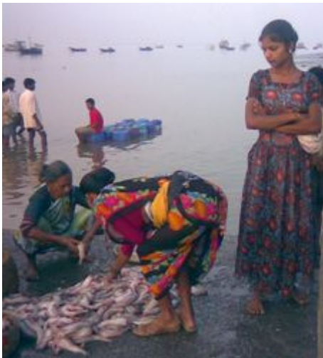
Fishermen bring their catch ashore to be sorted and gutted by their wives and daughters. Note the Portuguese style of dress. The old Portuguese culture is still very evident in Vasai even though the Portuguese left in 1739 after a 3 year seige.