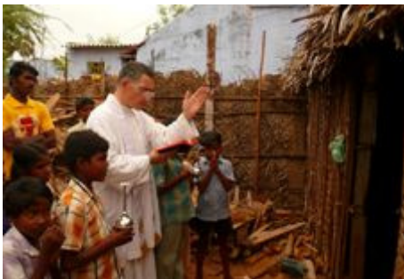
The houses of the faithful are blessed every year in the village of Singamparai as part of the festival.