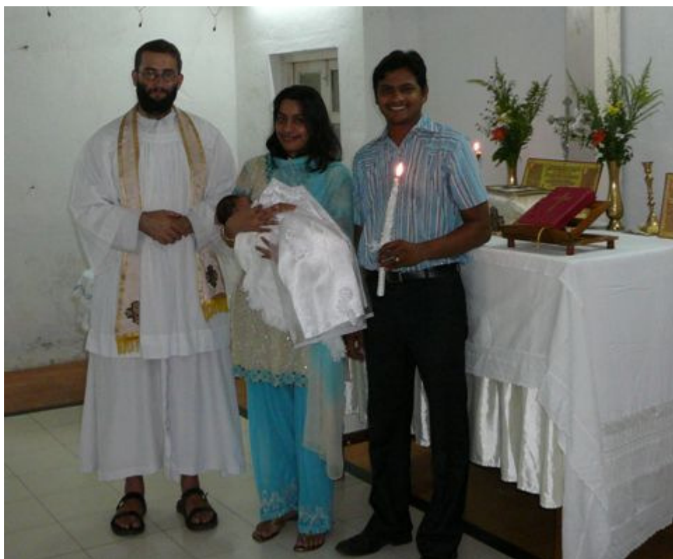
Baptism at the Pioneer Hall in Bandra, Bombay.