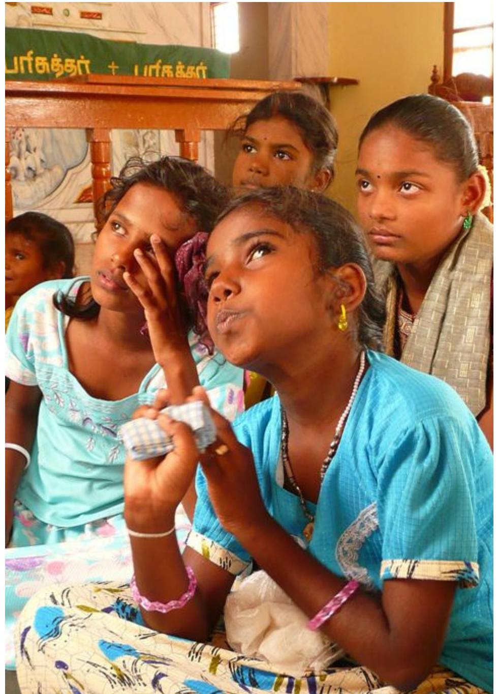
So Antoniarajam, what are the Twelve Fruits of the Holy Ghost?.