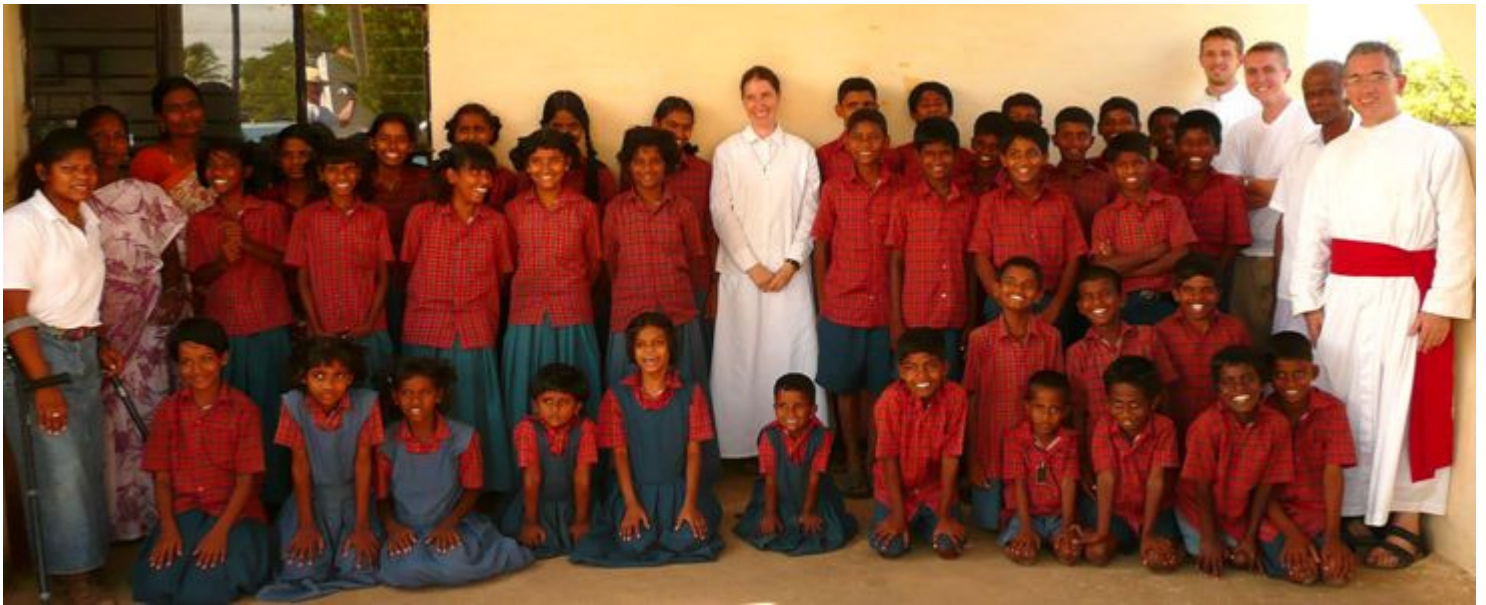
Veritas Academy 2008-9