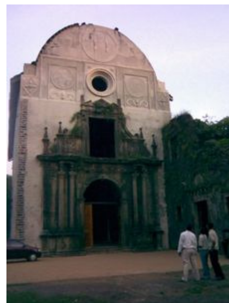
The facade of St. Gonsalo Garcia.