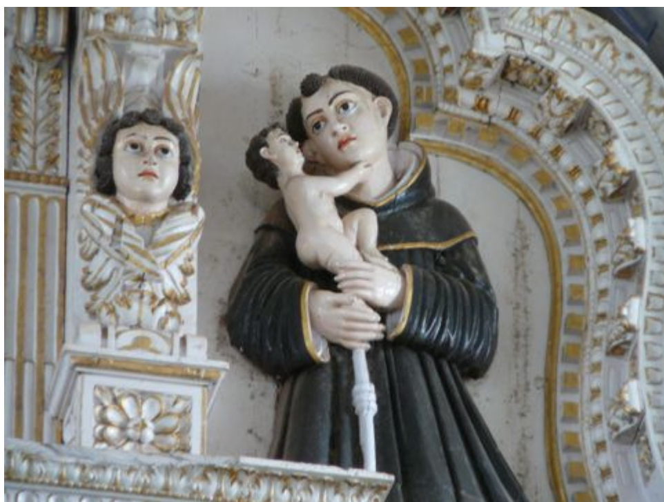
A touching St. Anthony & Child in Goa. Throughout India there is a great devotion to the saint.