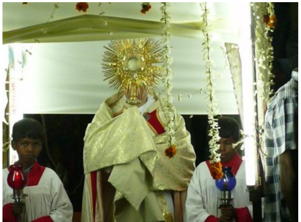
Ave Verum Corpus Natum de Maria Virgine.

climax is the procession of the Blessed Sacrament followed by the pulling of a decorated carriage through all the streets of the village. The festival is closed by lowering the flag and endless fireworks.