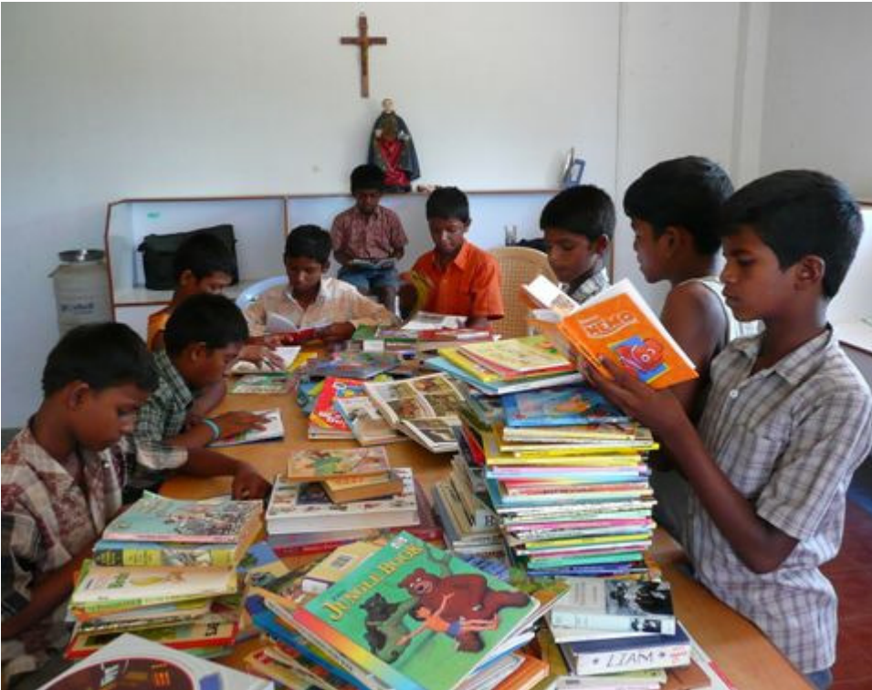
Some of the boys examine the new books that have arrived from our devoted faithful in Melbourne, Australia. Reading is the bread and butter (or rice) of education.