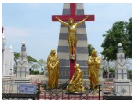
St. Thomas Mount, where St. Thomas the Apostle completed his martyrdom, Chennai.