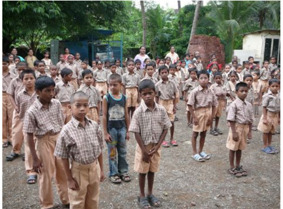
The orphans of the St. Gonsalo Garcia Orphanage in the Bassein Fort of Vasai. One ugly duckling shall find his uniform in a few weeks time.