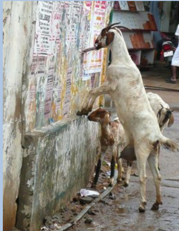
Ultimate recycling. When it rains, the rice paste glue turns a poster into a meal. Is this the future of advertising?