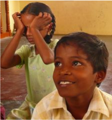
Weariness in class can happen.

It is the grammar of the trivium , giving us facts and definitions by which we can judge and reason. How many of us have deepened the understanding of our faith, or answered doubts that sometimes arise spontaneously in our minds, by returning to the treasure trove of the catechism? How many of us have been forced to defend the faith and have been able to pluck, from our childhood memories, an answer that delivers the coup de grace ? We probably did not understand many of the answers we learnt by heart as children, but the fruits of that learning manifest themselves throughout our lives.