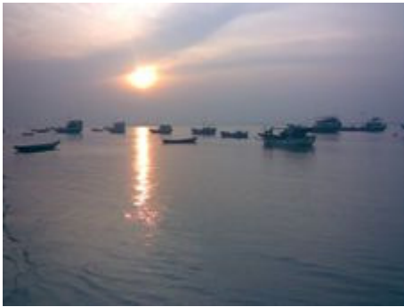
Outside the walls of Bassein Fort is a fishing village. This picture was taken at 6:30am.