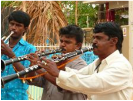
The band warms up for the big night.