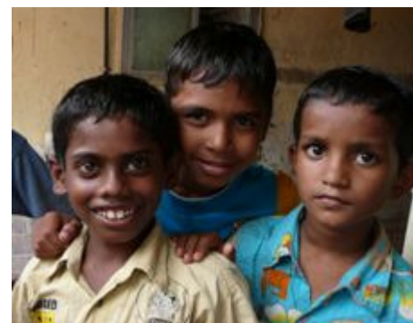
Tamil orphans all the way up north too.

Please pray that this new venture be blessed