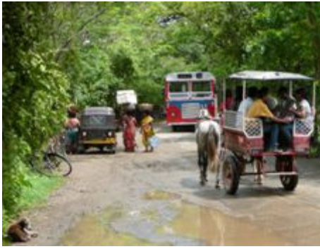
Horse drawn rickshaws on the peninsula of Gorai, where some of our faithful live.