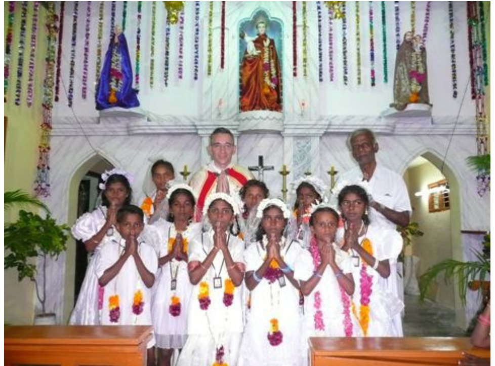
There were ten First Holy Communion on the last night of the festival.

■ 22nd July—3rd August. Many chapels in Tamil Nadu honour their patron saints by a festival lasting 13 days. The start of the festival is marked by the raising of a flag on a decorated flag pole. The