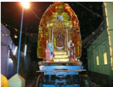
The statues of the Madonna & Child, St. Anthony & the Infant Jesus and The Guardian Angel on the decorated carriage.