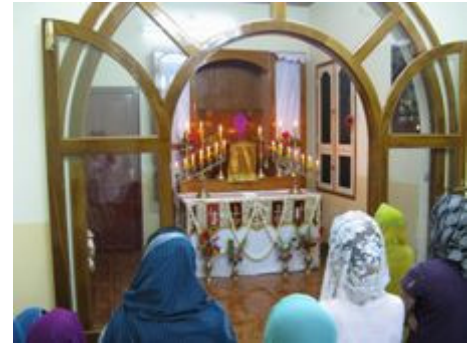
The Altar of Repose in an office of the priory.

▪ Advanced origami classes were organised to keep the boys busy during the holidays. The first class resulted in the building of two naval fleets which were subsequently sunk under heavy artillery