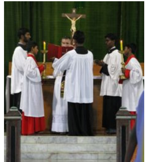
Behold the wood of the Cross.