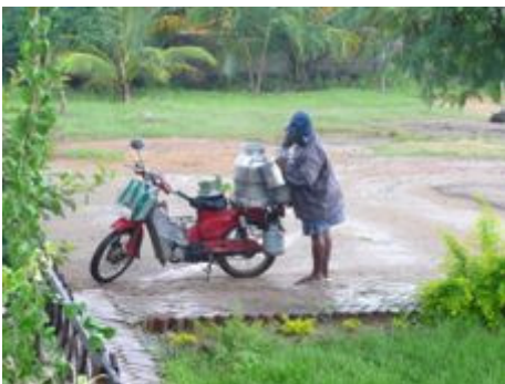
The Priory Milkman. Milk is delivered unpa- steurised and so must be boiled on arrival.