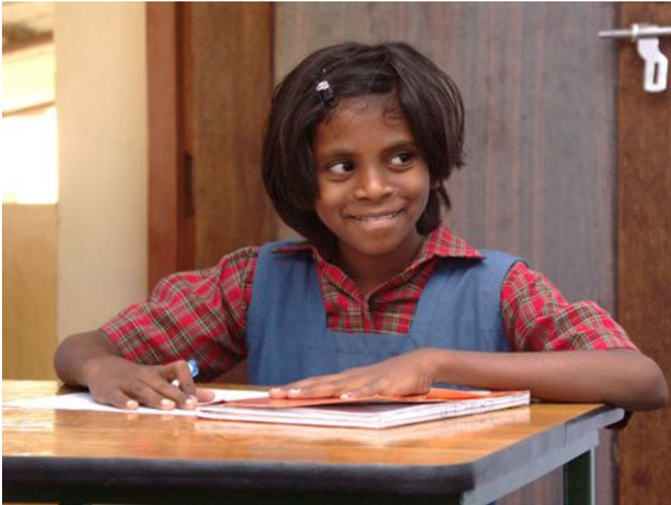
Mary Magdalene is clearly up to something.

we have in our teaching staff. We visited three colleges in total and asked for Catholic candidates only. Regrettably we found only three suitable candidates from twenty interviews and two of these failed to show up for their teaching test. It seems that Providence is telling us that we need more volunteers from abroad. We need teachers of English, Science and Geography. The vacancies arise due to the