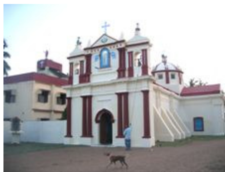
The Church of R.N.Khandigai

Please keep our apostolate in your prayers.