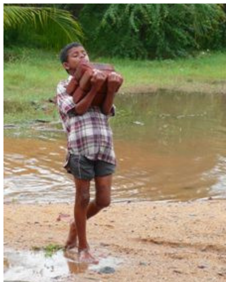
The boys work frantically on Maundy Thursday to build a path to the chapel.