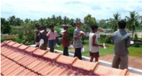
Flight testing from the roof of the priory. The fancier designs tended to fair worse.