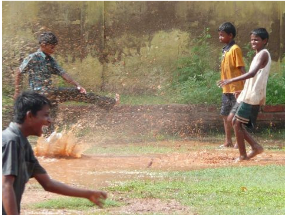
The boys play 'Catch the Flag' in the muddy grounds of the priory.

fire at the dam. The second lesson concentrated on the delicate creation of paper aeroplanes. These were then tested from the roof of the priory.