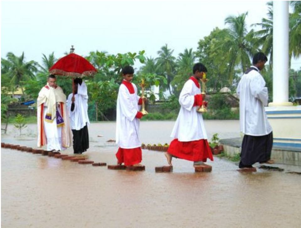
One of the more unusual Blessed Sacrament processions from the Altar of Repose.

the tetanus bacterium. He twitches uncontrollably and languishes for hours with sorrowful eyes. He will not be with us for much longer. The Lord giveth and the Lord taketh away.