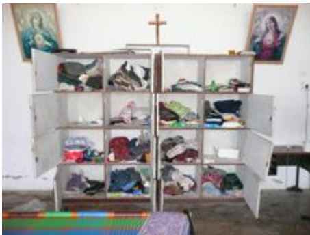
A surprise locker inspection reveals alarming disorder in the boys' dormitory. Each boy has one locker containing his wardrobe and treasured possessions.