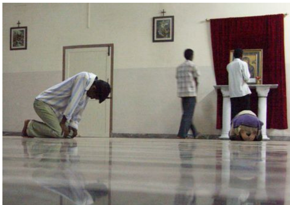
Shutting the door to interference is the active side of the virtue of peace of mind.

(a) First of all, at times which are not strictly times of prayer, seize the opportunities for ejaculatory prayers [e.g. “Jesus, I love Thee,” or “Jesus, my Lord and my God” etc.], or a visit to the Blessed Sacrament, or to pray the Angelus. Pray when nature is not in conflict; gradually nature itself will learn to “taste and see how