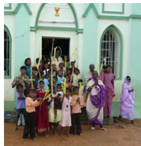
Some faithful of St. Anthony's Chapel, Singamparai, on Palm Sunday.