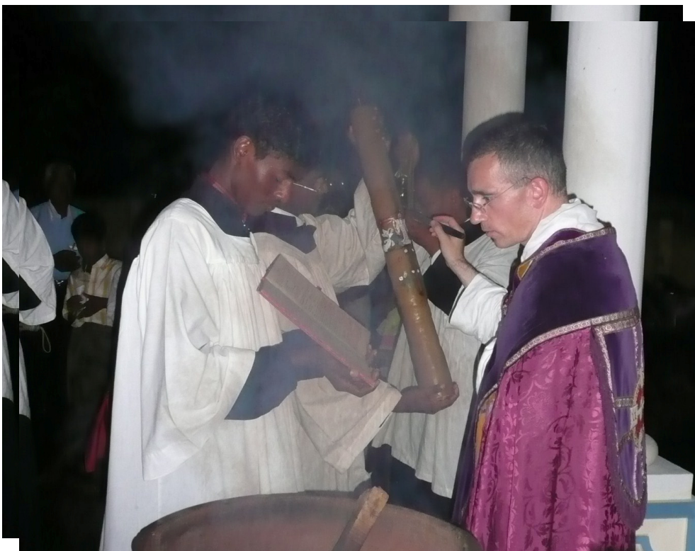
Christus, heri et hodie.