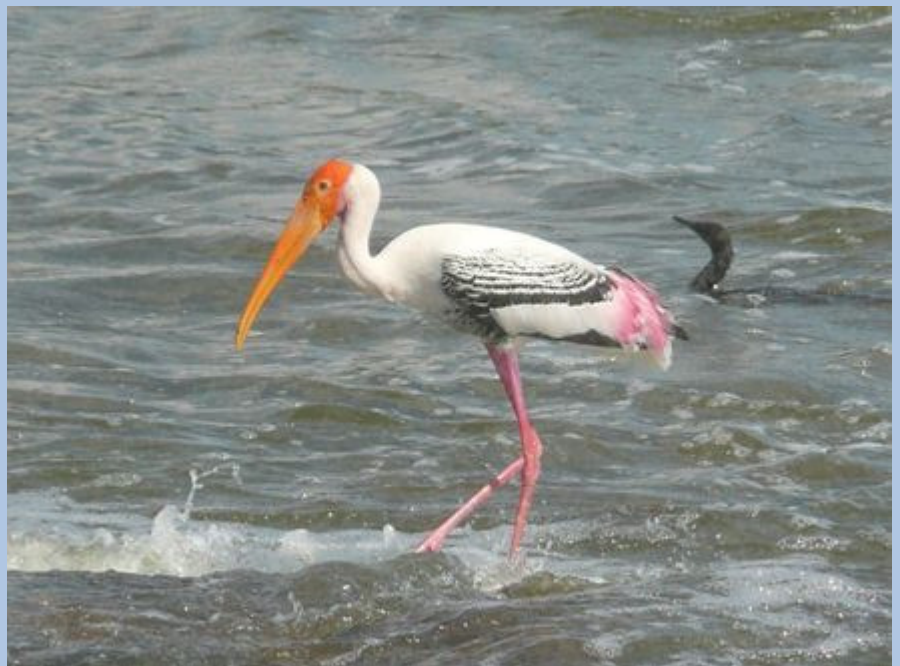
A colourful Painted Stork (with a Little Cormorant in the background) enjoying the flood waters of the unexpected second monsoon.