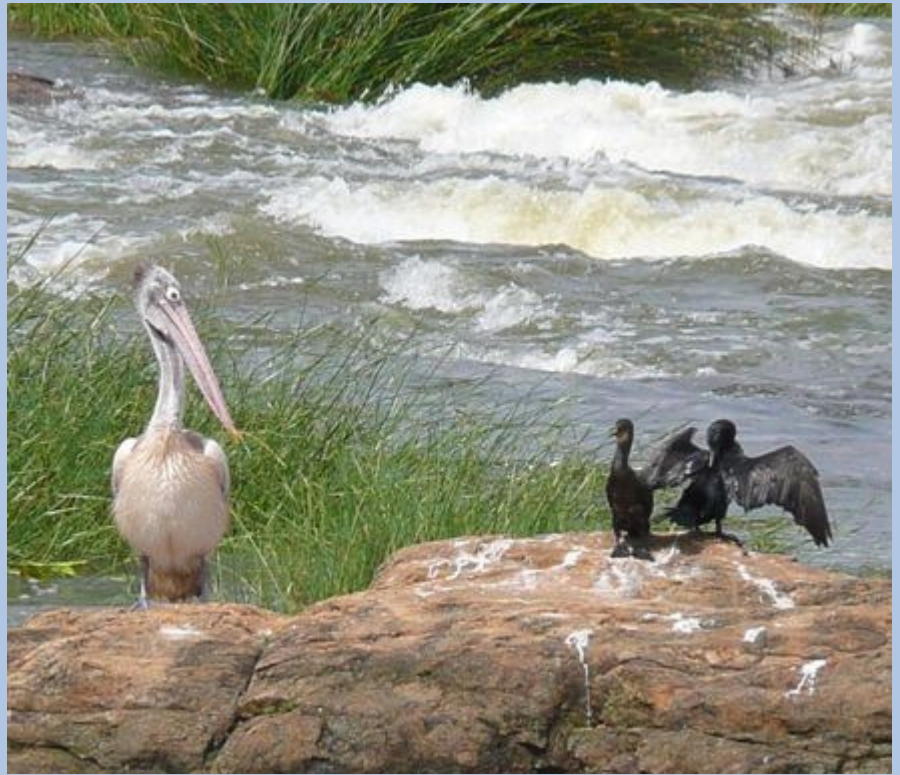
"And the Pelicans think we're ugly," said the Little Cormorant to his friend.