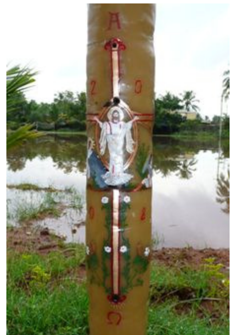
The Paschal Candle was made at the priory from melted wax and painted at the orphanage by one of the volunteers.