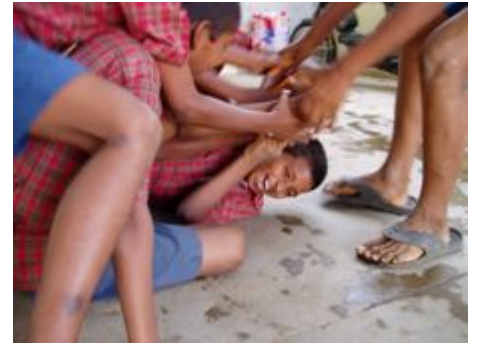
Violent games are strictly banned at Veritas Academy.