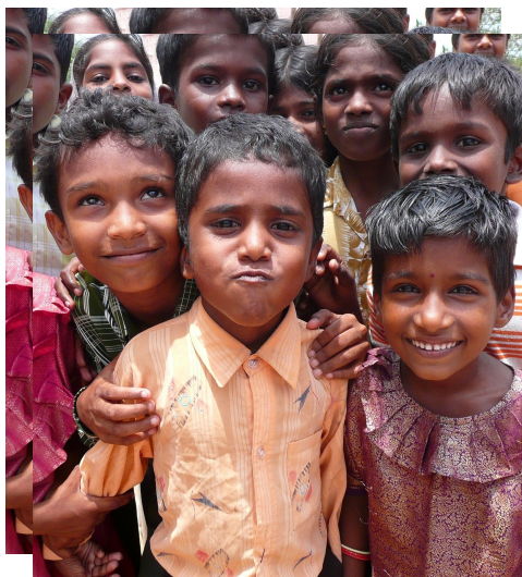
A Singamparai street gang.

can you subscribe to the Apostle so that we can acknowledge your donations. God bless America!