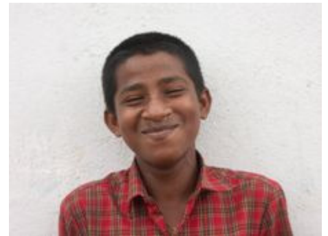
Laughing is also frowned upon.