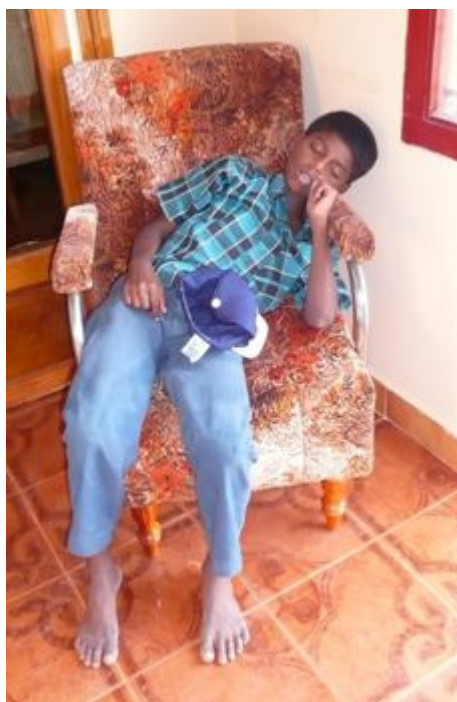
Our minds easily wander to the moon.