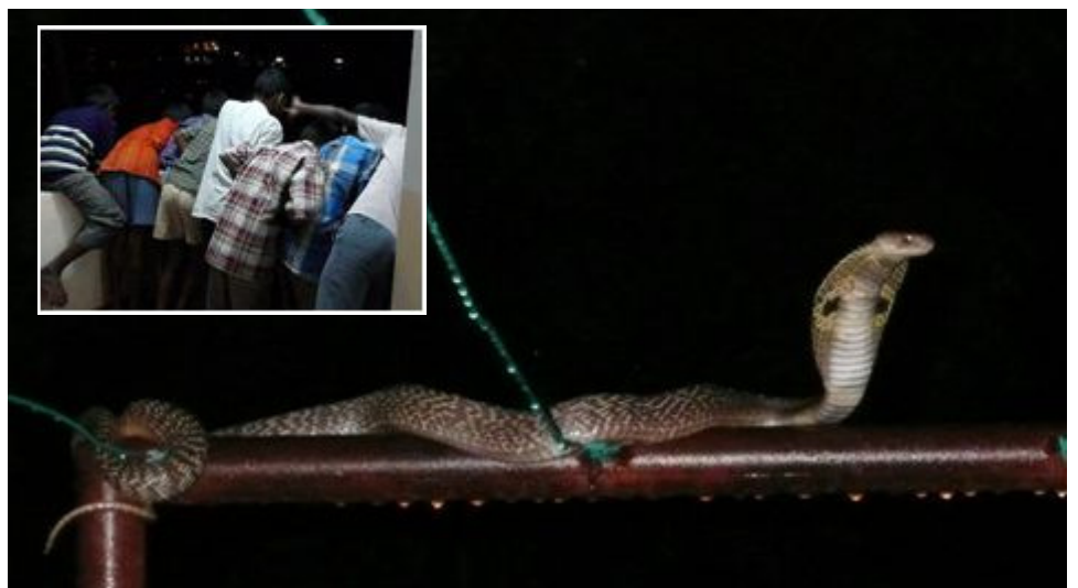
A Cobra was flushed out of his home by the recent rains and installed himself on our washing line. The boys looked down from the balcony to witness the successful hunting expedition that followed.