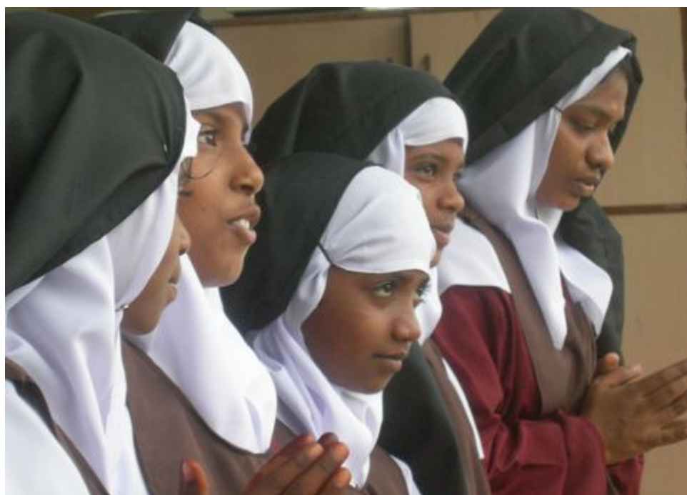
By the foreknowledge of God, our prayers are woven in into His providential plan of the universe.