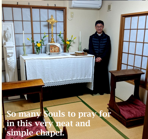
So many Souls to pray for in this very neat and simple chapel.