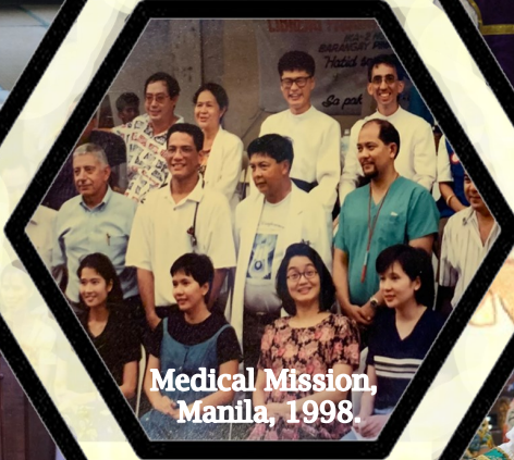
Medical Mission, Manila, 1998.