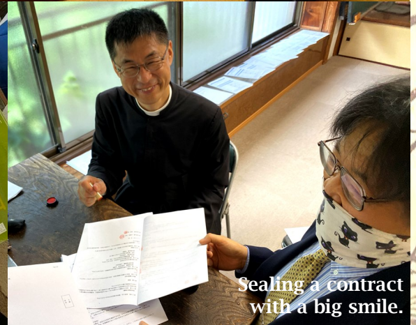
Sealing a contract with a big smile.