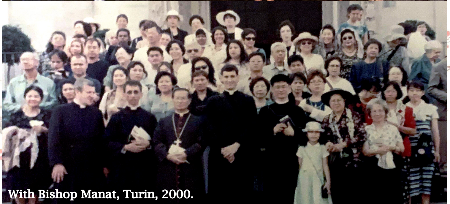
With Bishop Manat, Turin, 2000.