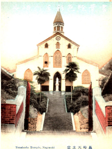
Tenshudo Temple, Nagasaki