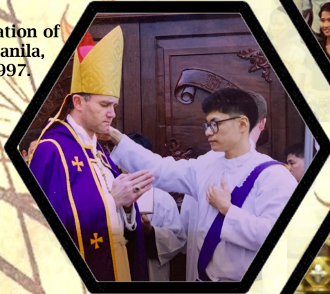
Consecration of OLVC, Manila, March 1997.