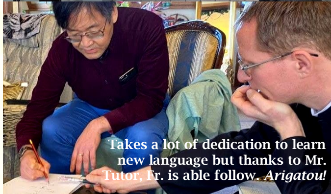
Takes a lot of dedication to learn new language but thanks to Mr. Tutor, Fr. is able follow. Arigatou!