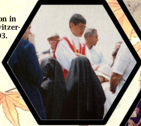
Ordination in Écône Switzer- land, 1993.