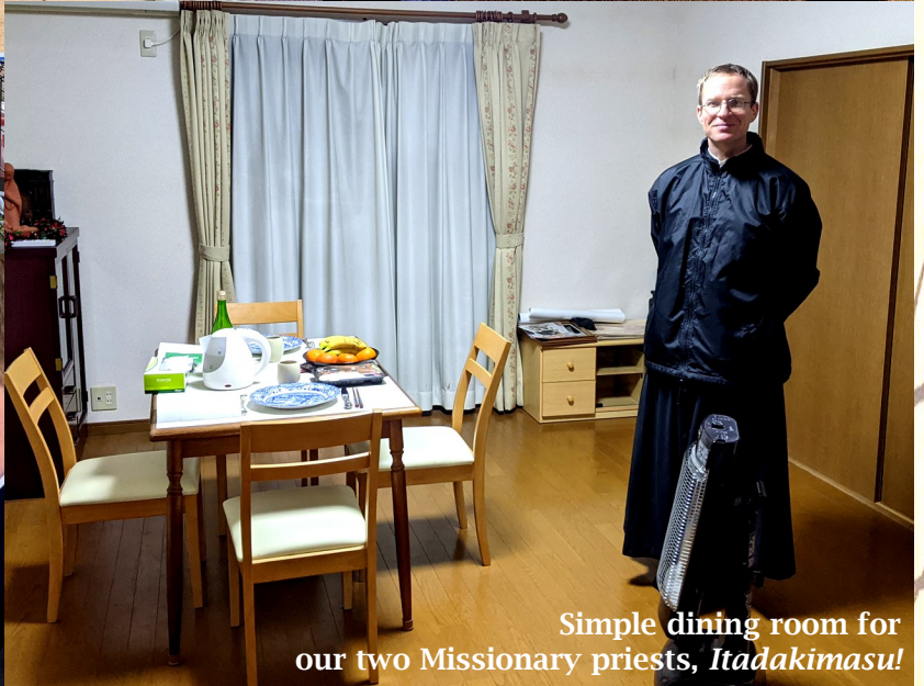
Simple dining room for our two Missionary priests, Itadakimasu!