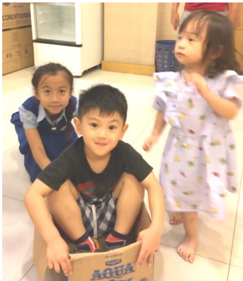
The future of the Church in Asia. (Children from Palayamkottai -India- and Balikpapan -Indonesia-)