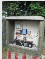
Farming electricity: Solar (The panels following the sun for maximum efficiency) and or wind .. the control center .. saving us about 200US$ per month.