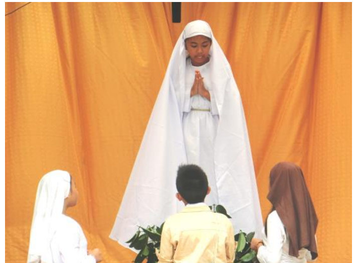
Pupils of Our Lady of Victories School (Manila, Philippines).

2 - Teaching of the signification of the visible things linked to the Holy Mass: such as the symbolism of the altar, the gestures in the ceremonies, the meaning of colors, vestments, flowers, incense, lights and chants. The altar boys and the school choir are specially trained, not only to enable them to perform well their tasks, but also to foster a deeper understanding of their roles in the service of the Holy Mass.