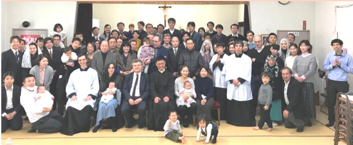
The community has now reached 90 faithful in Tokyo (Japan).