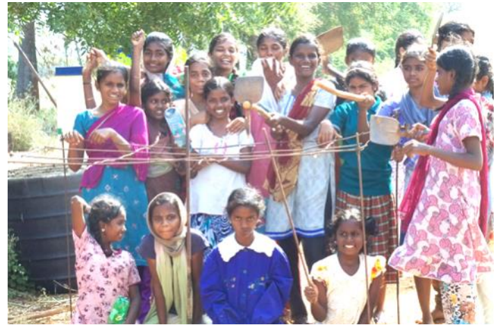
The girls teamed up to plan the construction of a new shrine to the Blessed Virgin Mary.