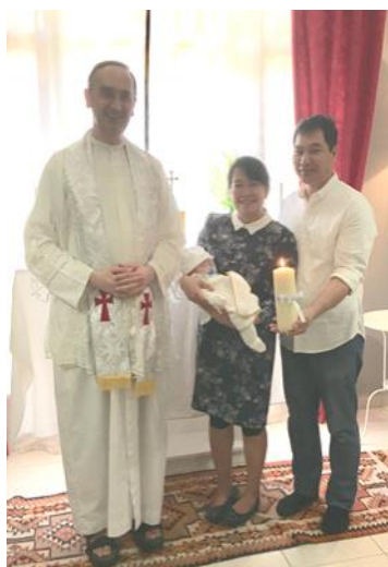
Baptism in Abu Dhabi (UAE).