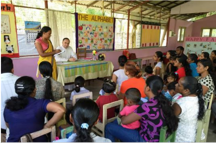
The current Montessori and Prep School in Negombo (Sri Lanka).

Our missionary work would not be complete if we omitted the education of our children. It is very difficult to run schools in Asia. But Divine Providence has made it possible that we have one in India, another in the Philippines, and one planned for Sri Lanka.