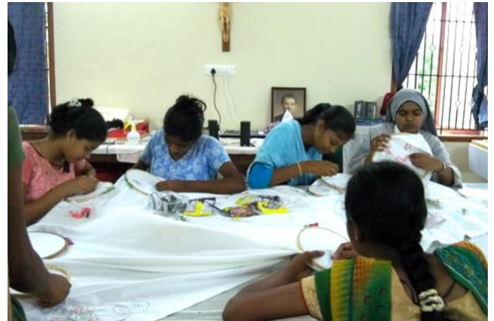
While construction commenced on the shrine, our young girls headed inside for sewing classes with the Sisters.