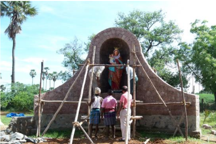
But it took the engineering prowess and muscle of our men to make the beautiful shrine a reality.