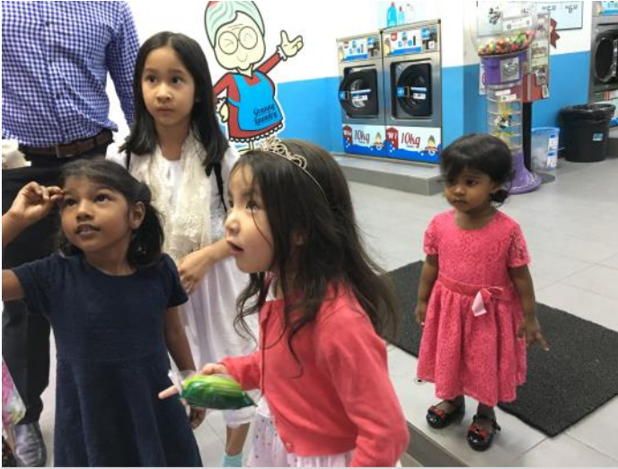
Children in Kuala Lumpur (Malaysia).

treat. At Mass they are to realize that they are attending the drama of Calvary in the midst of the Sorrowful Mother, St. John and St. Mary Magdalene. When they read the Gospel, it is Jesus Who opens the tabernacle from inside and comes forth to tell them what He once told His apostles and disciples.