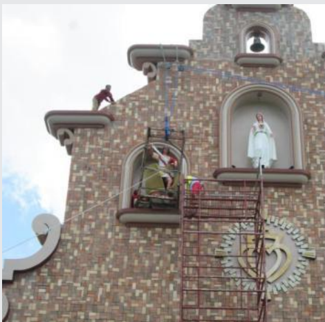
St. Michael is the patron of the Brothers of the Society and St. Elizabeth of Hungary the patron of the Iloilo archdiocese.