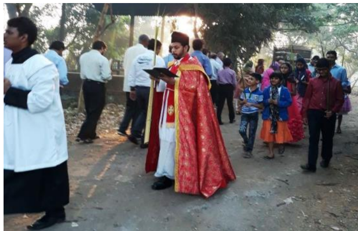
Palm Sunday Procession in Vasai (India).