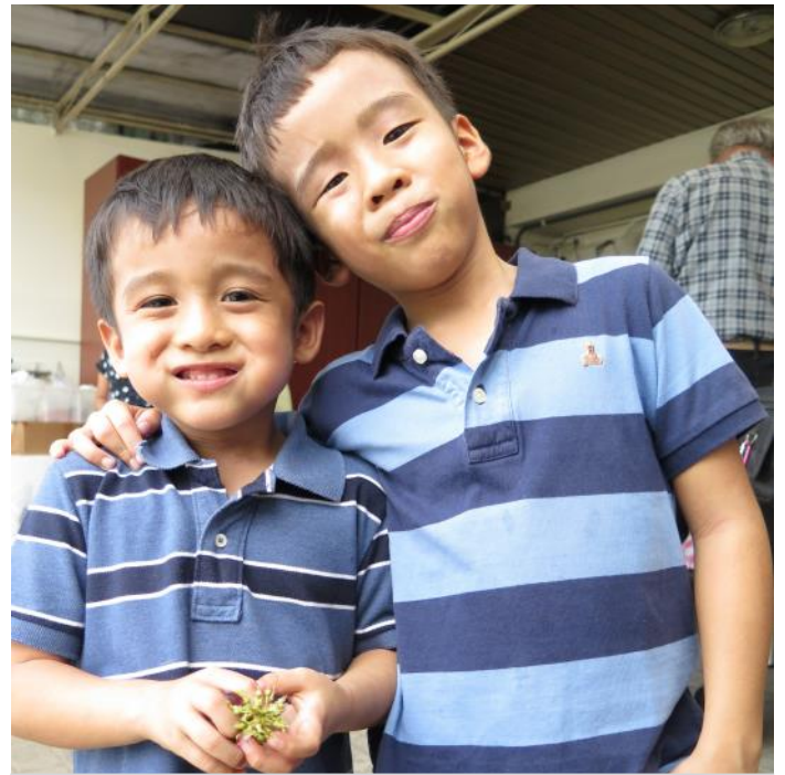
Filipino faithful in Singapore.

the King of Kings adored by all angels and saints is unknown here on earth - "He came unto his own, but his own received Him not". Asian people generally take pleasure in giving to their friends "a warm welcome."