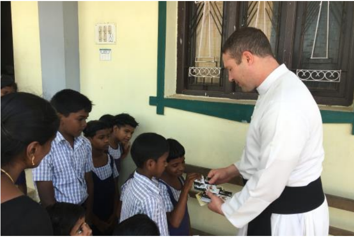
Father exploits our poor children by selling them raffle tickets only valid in the United States.