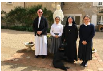
Asian Postulants in Ruffec (France).