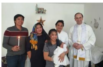
Baptism in Dubai (UAE).