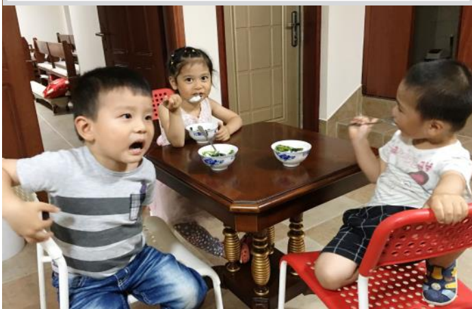
Young faithful in China.

On the intellectual level the Holy Mass and its preaching are explained in catechism classes.