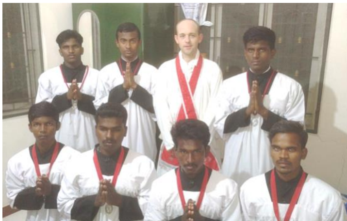
Enrollment in the Archconfraternity of St. Stephen in Trichy (India).