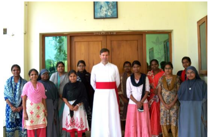
They survived all five days of silence and reflection. The women were pleased: the Retreat concluded with meditations on Heaven!