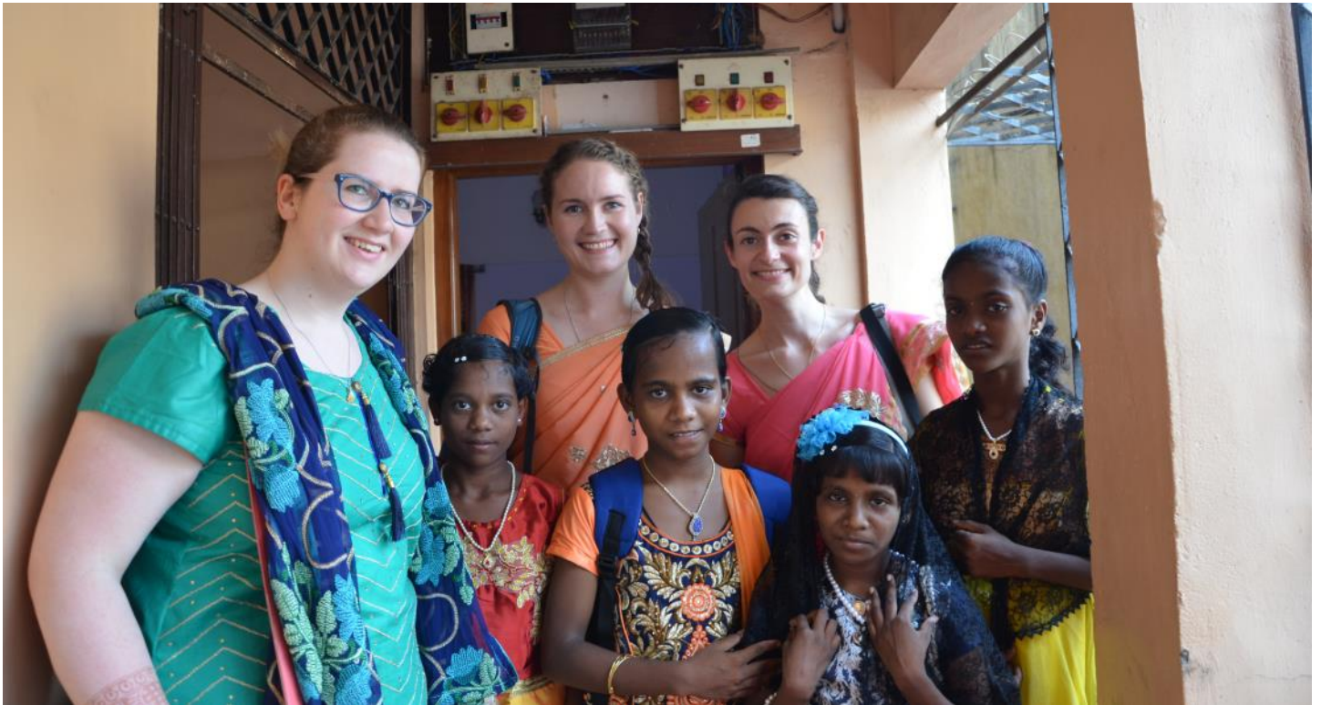
A happy reunion 2018